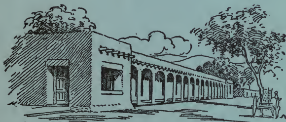
PALACE OF THE GOVERNORS

PUBLISHED QUARTERLY BY THE HISTORICAL SOCIETY OF NEW MEXICO AND THE UNIVERSITY OF NEW MEXICO